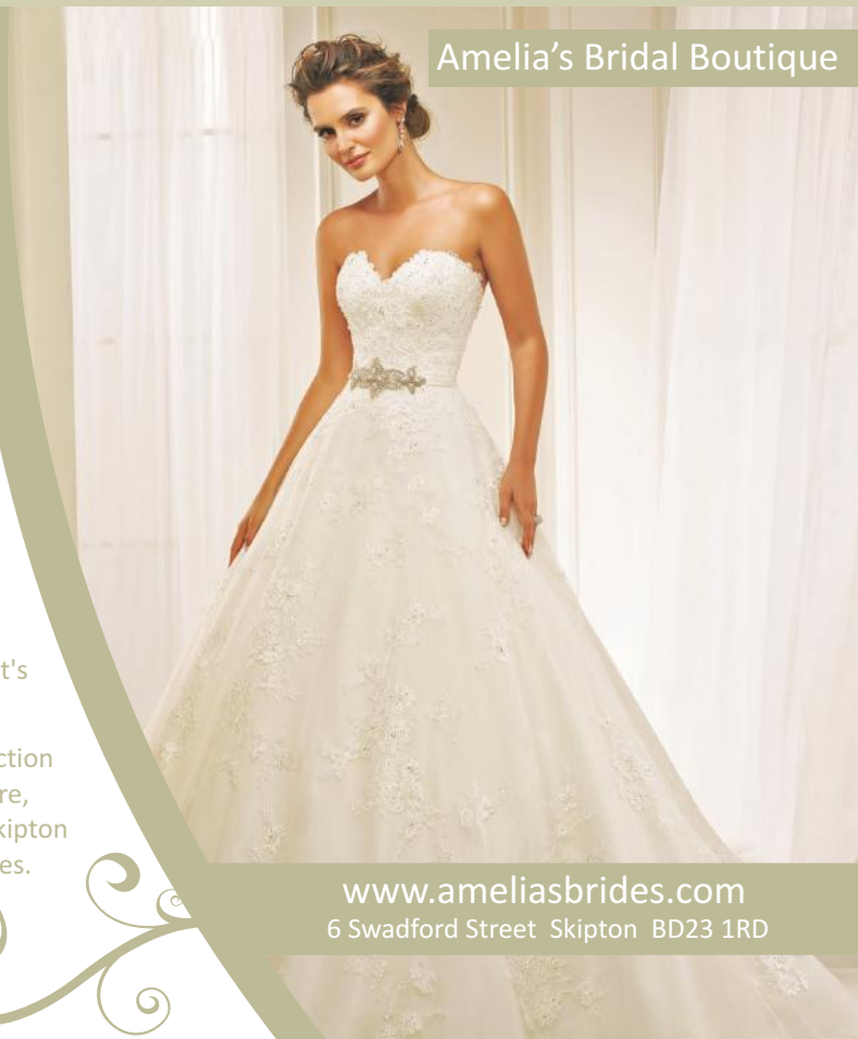
Amelia's Bridal Boutique