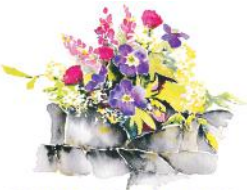
THE YORKSHIRE DALES FLOWER COMPANY

Initially you would have a free consultation at The Yorkshire Dales Flower Company, or a mutually convenient place, to discuss your wedding flowers from which an individual quotation would be prepared tailored to your requirements, ensuring perfect flowers for your wedding day.